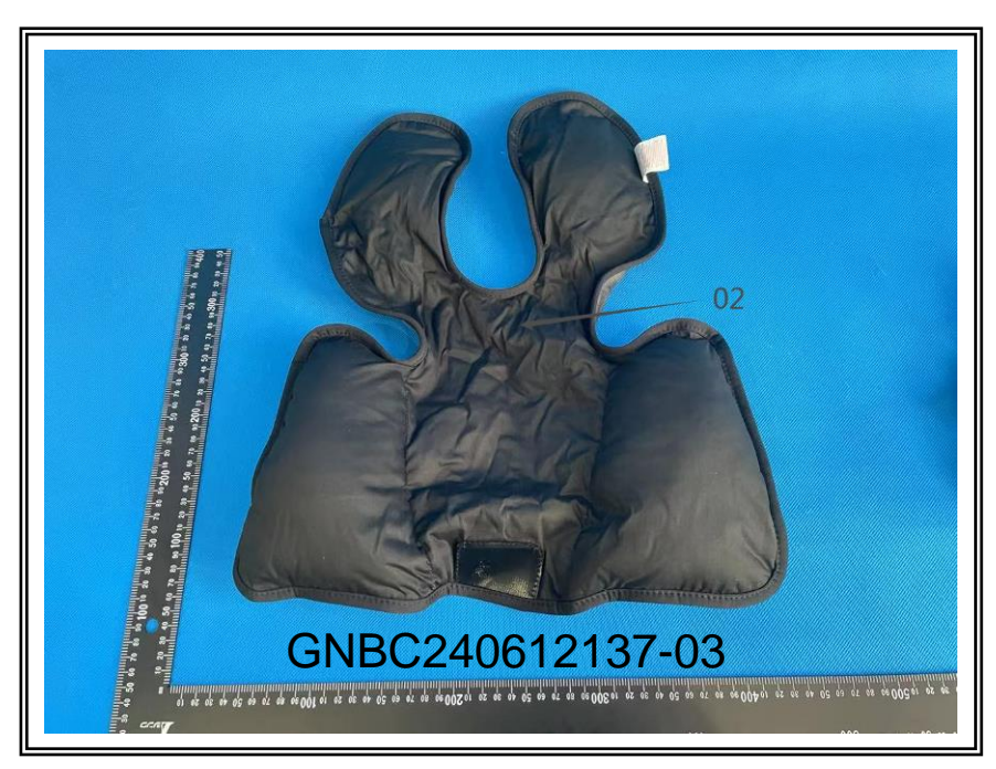
GIG authenticate the photo(s) on original report only